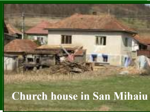
Church house in San Mihaiu